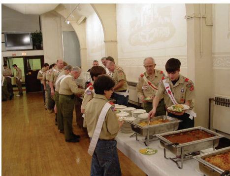
Members enjoy a Swiss Meal from Turner Hall

The Brotherhood Bash was held in December the Kiwanis Cabin in Monroe, Wisconsin. Eight members sealed their memberships and became Brotherhood members. It was a very successful day, but we are looking for a new, more central, location for next year. If you have an idea of a location for the winter Brotherhood Bash, please contact us.