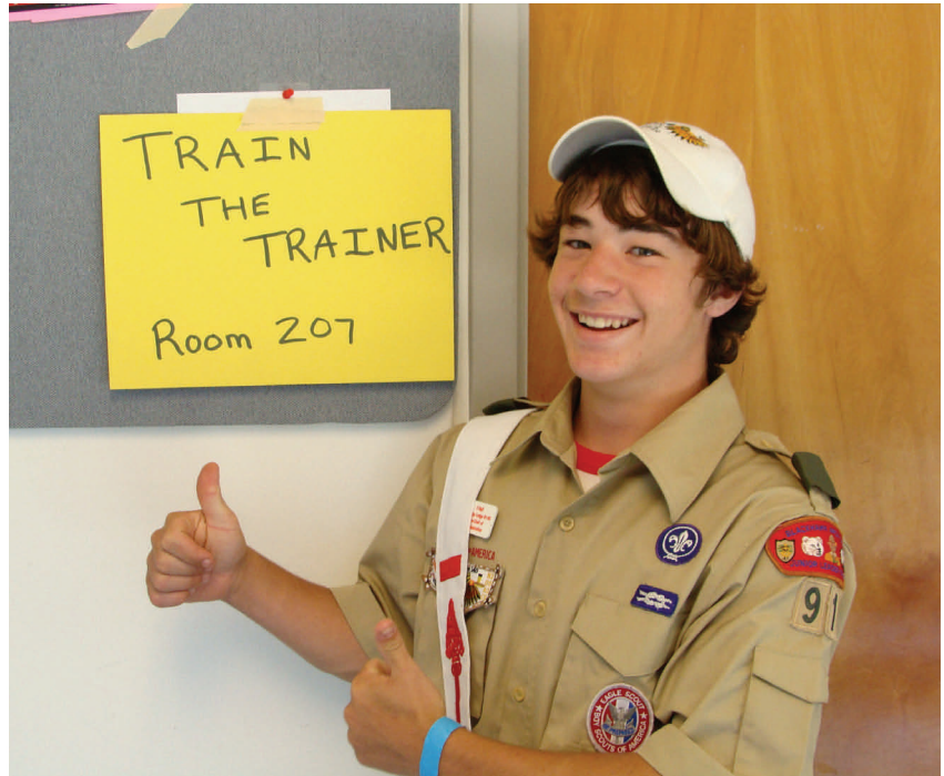
Our Vice Chief of Activities at the 2008 Section C-3B Conclave