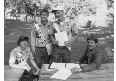
Members of the Lodge Executive Committee at Fall Conclave 2008

2009 has just begun and there is no better time to be an Arrowman than now. As the year begins we look ahead to what opportunities we will face. As we head into our spring season we will have our Spring Fellowship at Camp Lowden where we will help get the camp ready for summer season and enjoy the fellowship of our brothers. As a Lodge Executive Committee (LEC) we have set certain goals and we need your help to achieve these goals. We would like to reach Quality Lodge, but we know that we must set smaller goals in order to reach big ones. At our Lodge Leadership Development meeting we set a few goals to achieve by the beginning of next year. If you have any recommendations please contact us